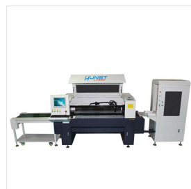
Auto Cutting Process Solution For ...