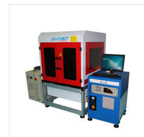
3D laser marking machine