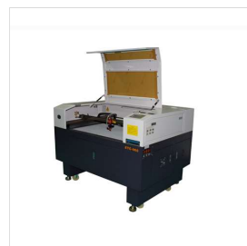
motorized up down table laser cutter