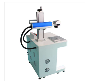
Metal Fiber laser marking machine