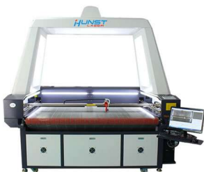
large format SLR camera laser cutter