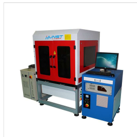
3D laser marking machine