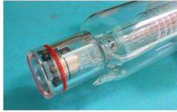
Terminal of high voltage and insulating sheath