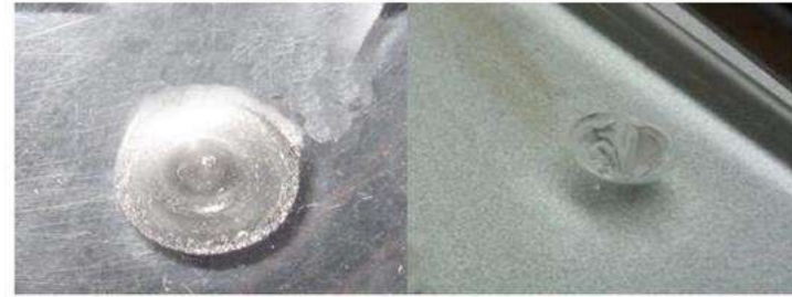
Laser spot with depth of 5mm