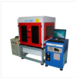
3D laser marking machine