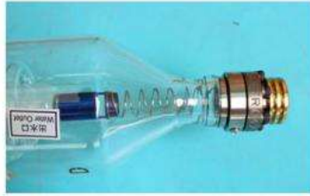
Negative electrode container