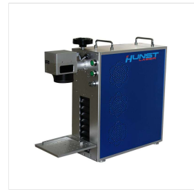
Mini desktop laser marking machine