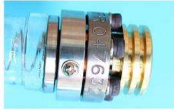
Product number in metal terminal