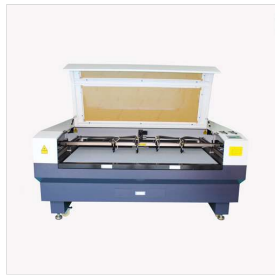
four head high efficiency laser cutter