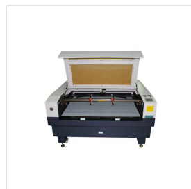
fabric leather double head laser cu...