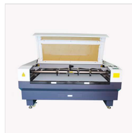
four head high efficiency laser cutter