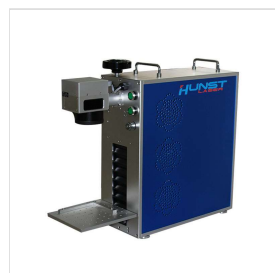
Mini desktop laser marking machine