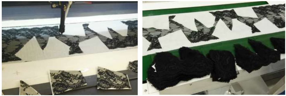
To satisfy your cutting needs , all you need is Hunst Large Vision Laser Cutting Machine