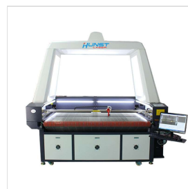
Large Fomat auto position laser Cu..