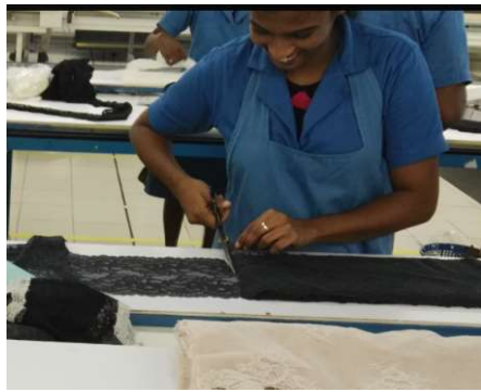
③position using steel needle punching

Add: No. 3, yangwu road, shangjia, wanjiang district, dongguan city, guangdong province, China.