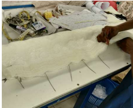
5. Multi-layers Manual cutting