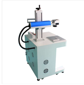
Metal Fiber laser marking machine