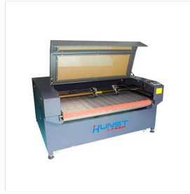
auto feeding laser cutting machine