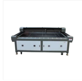
flat bed laser cutter